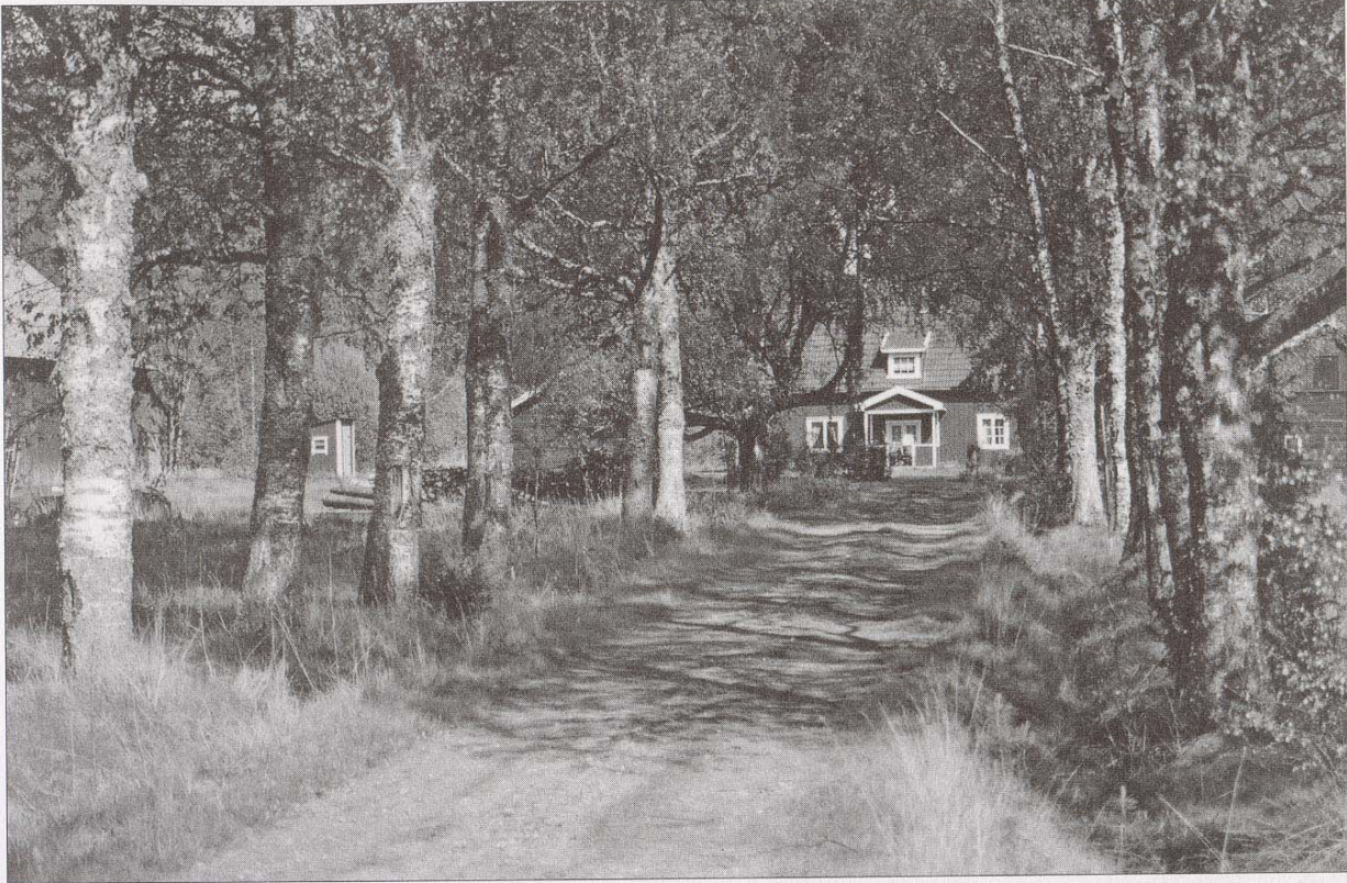
Birch trees border the road to the little farm Hulan, possibly the place where the Rapp family lived in 1879.

An example of one of the many photographs of Sweden that appear in the book. This one ties in with a case study of the Rapp family.